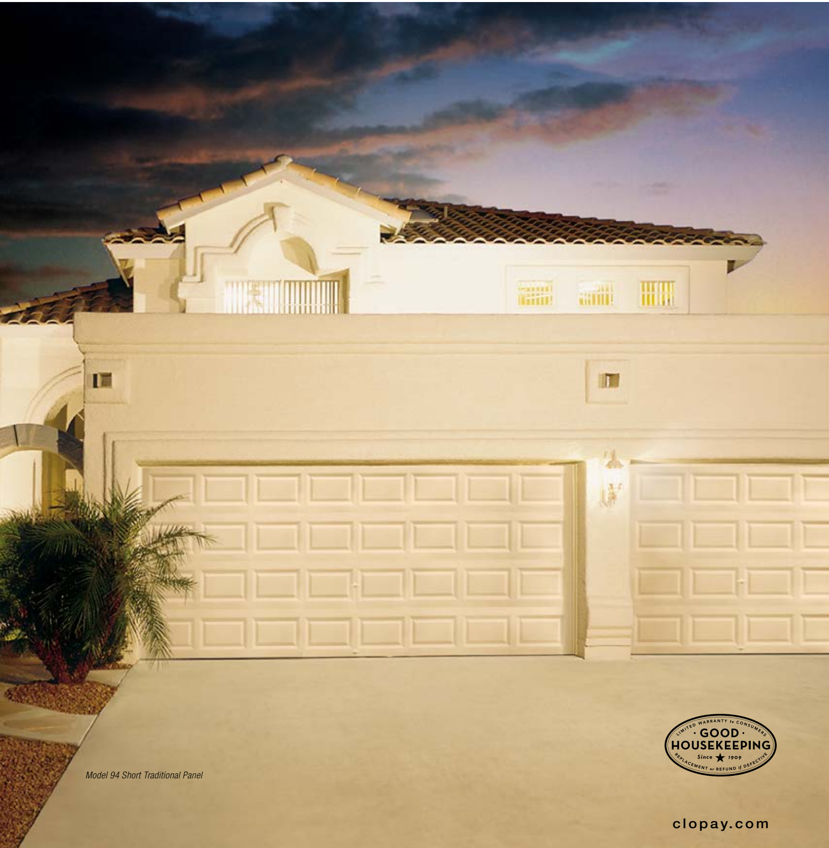
Model 94 Short Traditional Panel