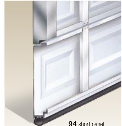
94 short panel