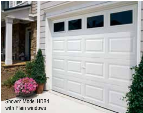
Shown: Model HDB4 with Plain windows