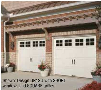
Shown: Design GR1SU with SHORT windows and SQUARE grilles

Models GR2SU, GR2LU (18.4 R-Value*) Models GR1SU, GR1LU (12.9 R-Value*)