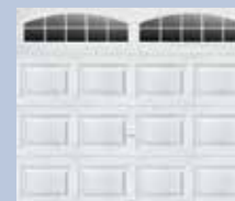
Long with Grille

See pages S19-S20 for all available window designs and options.