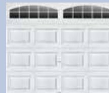
Long with Grille

See pages S19-S20 for all available window designs and options.